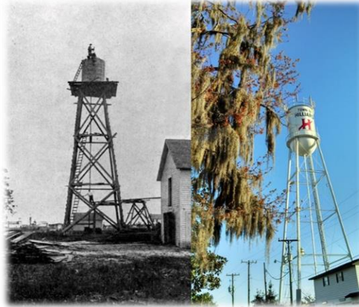
Here is a photo of the Original Water Tower and then Today's!