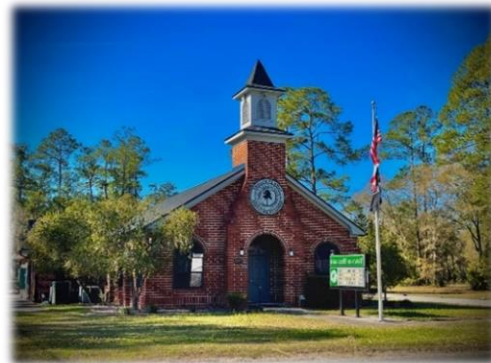
The photo on the left was taken about 1940, the photo on the right was taken 2021.